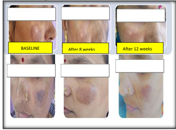
Image showing Improvement of the Melasma after treating with Tranexemicacid

In the present study there were minimum adverse effects like erythema, wheal, localized burning sensation etc.